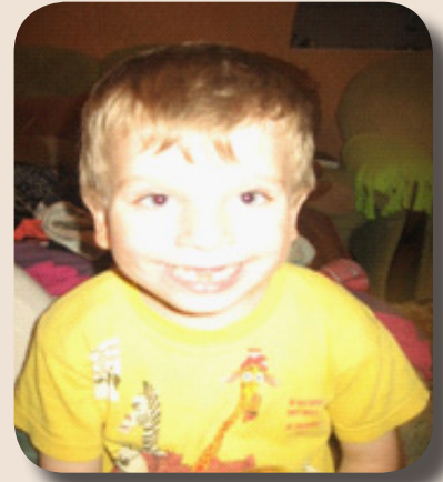
"Such Is the Kingdom of Heaven" - Jesus