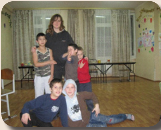
Children in Ezra's Children's Shelter