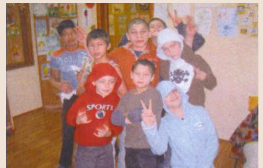
Happy Children In A Loving Environment