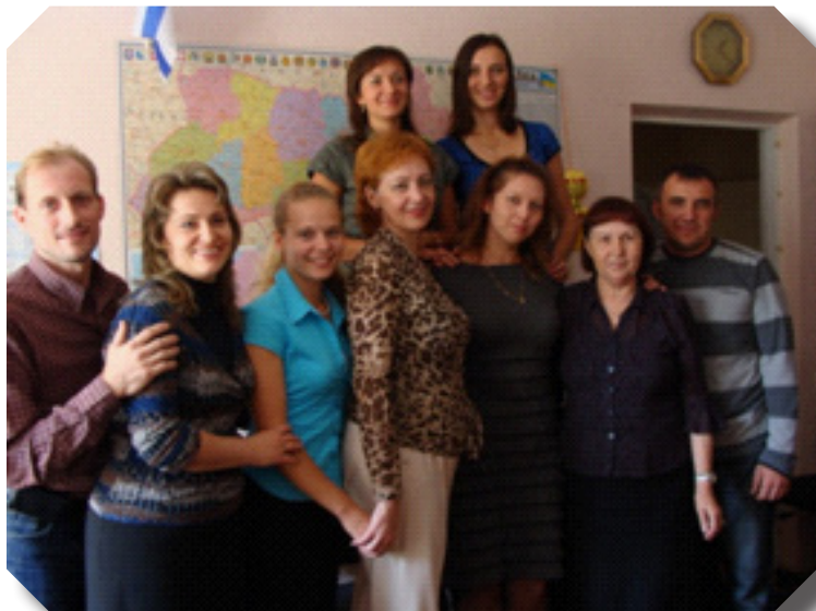
Ezra International Staff in Kiev, Ukraine